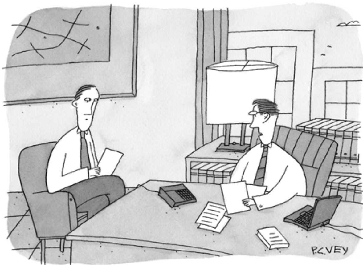
Exhibit 1: Cartoon by P.C. Vey, The New Yorker , March 9, 2009.

"These new regulations will fundamentally change the way we get around them."